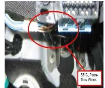
F250/350/450/550 CABIN / INSTRUMENT PANEL

-BLUNT-CUT ACCESS WIRES FOR SEI, "CUSTOMER ACCESS" SIGNAL CIRCUITS FOR CTO,VS_OUT,PARK TRO-N, & 4 PASS-THRU WIRE, ARE BUNDLED TOGETHER AT THE HARNESS ABOVE THE PARKING BRAKE PEDAL ASSEMBLY BEHIND THE DATA LINK CONNECTOR.