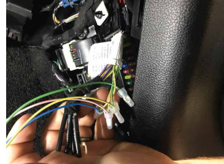
F250/350/450/550 PASSENGER SIDE /KICK PANEL

-BLUNT-CUT ACCESS WIRES FOR SEI, "CUSTOMER ACCESS" SIGNAL CIRCUITS FOR CTO,VS_OUT,PARK TRO-N, & 4 PASS-THRU WIRE, ARE BUNDLED TOGETHER AT THE HARNESS ABOVE THE PARKING BRAKE PEDAL ASSEMBLY BEHIND THE DATA LINK CONNECTOR.